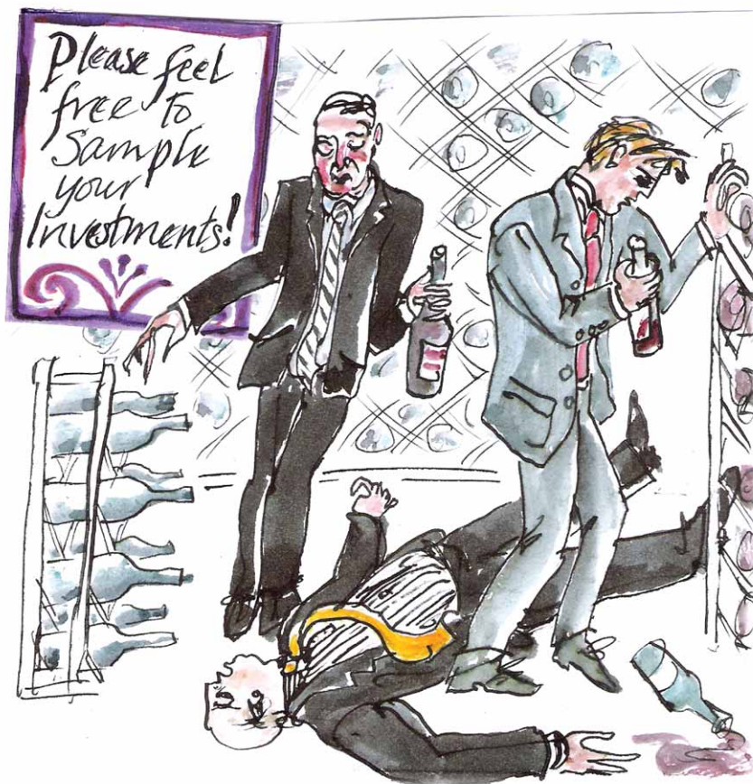
“Other risks of diversifying investments”

made is typical of the market. Some managers demand higher incentive fees, but if they are getting the returns, the client is probably going to want to pay them.